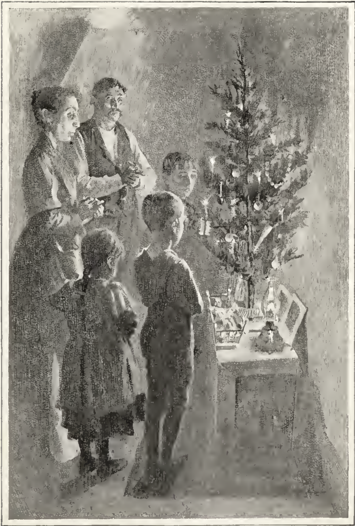
MERRY CHRISTMAS IN THE TENEMENTS.